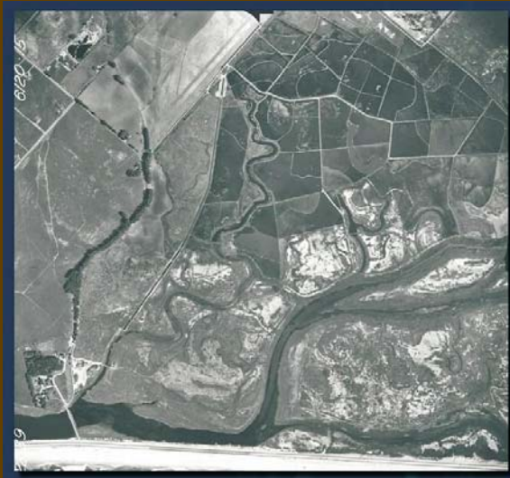
Bolsa Chica Wetlands. . .